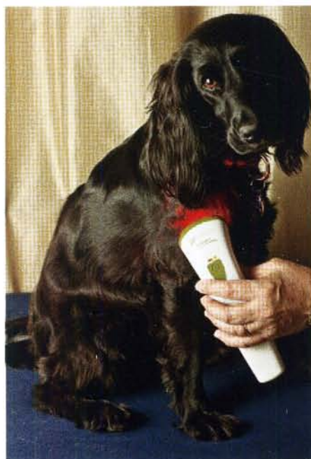
Figure 1. Simple treatment with a modern LED device

wavelengths that produce a more diffuse light so that larger areas can be treated at a time. The diodes are very robust, lightweight, and produce virtually no heat.