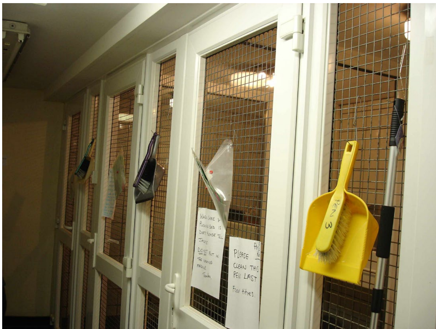
Figure 2. In this FCoV-aware veterinary cat ward, each pen had its own brush and shovel so that no pathogen fomites would be spread from pen to pen on brush bristles. Brushes and shovels were disinfected between pen occupants.

2019). However, different cat litters have been shown to have different abilities to inhibit FCoV in vitro , and Fuller's Earth-based cat litters were able to prevent infection of cell culture, while sawdust-based cat litters had little inhibitory effect on the virus. In two households, there appeared to be less virus shedding on a Fuller's Earth non-clumping cat litter (Dr Elsey Cat Attract) (Addie et al., 2019).