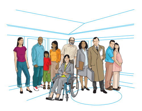
National Association for Patient Participation April 2016

A guide to help Patient Participation Groups and their GP practice work well